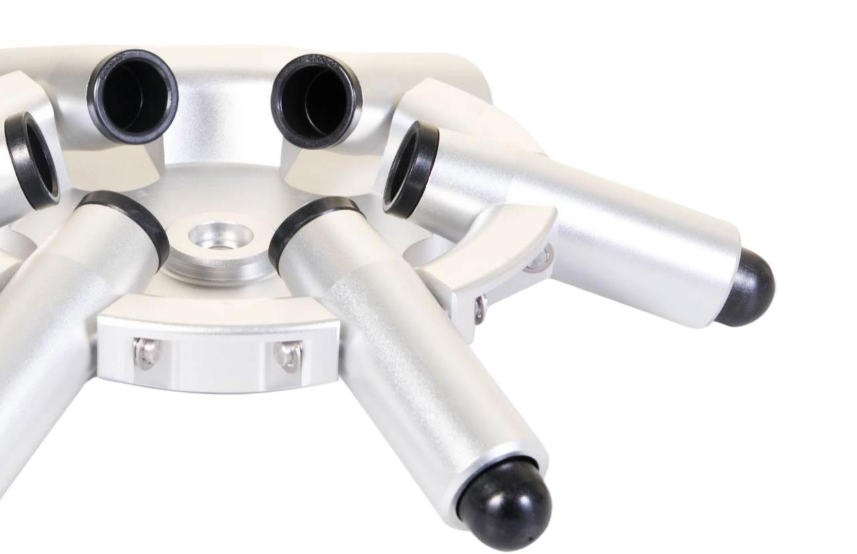
24 Place Fixed Angle