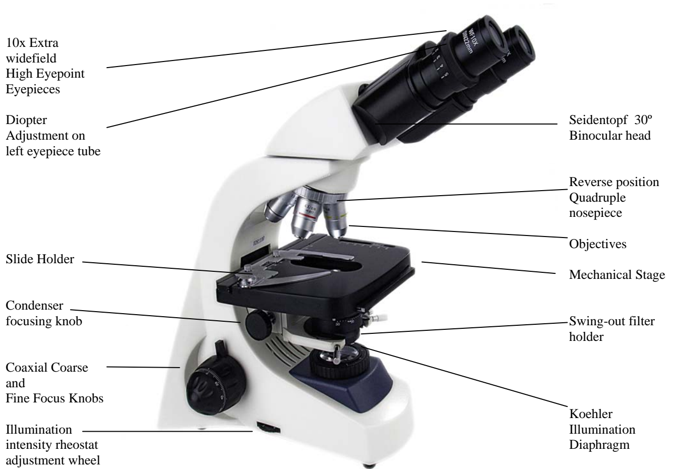
UNICO® IP730 Series Compound Microscope