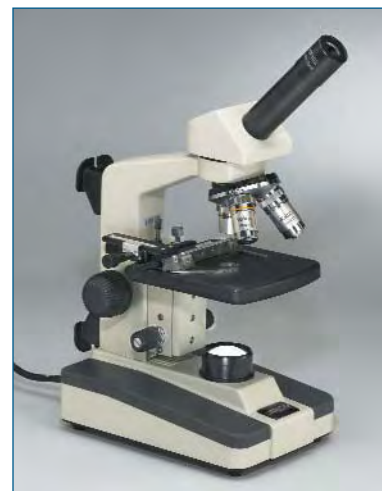
M220FL-M Compound Microscope

Buy with confidence! UNICO's Limited Lifetime Warranty protects your investment.