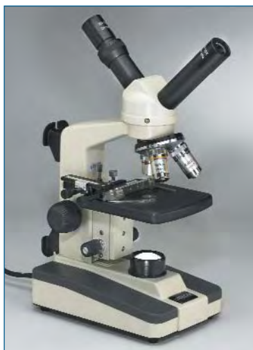
M220FL-DM Compound Microscope

Buy with confidence! UNICO's Limited Lifetime Warranty protects your investment.