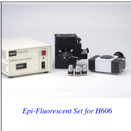
Epi-Fluorescent Set for H606