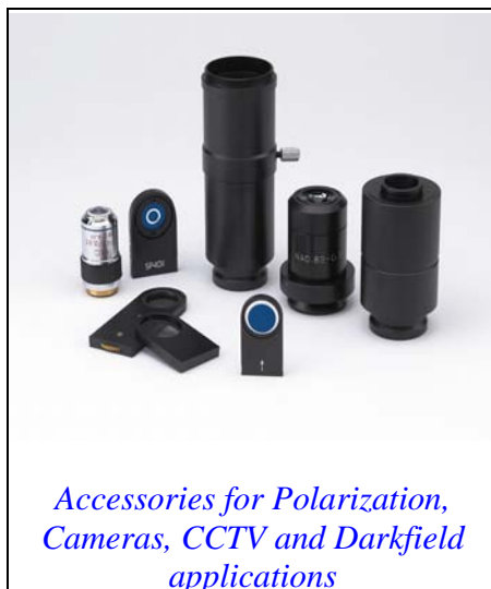
Accessories for Polarization, Cameras, CCTV and Darkfield applications