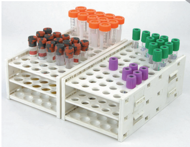
The top shelf of each T-Rack has cross-referencing Alpha – Numeric designations so you can track the exact location of specific tubes in the rack.