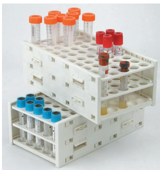
Mix and match to meet your needs, or to help with Accessioning.

The only rack you will ever need! Starting with a single 50 place T-Rack, you can attach as many racks together as you have room for! These patented racks quickly and easily attach together with their unique built-in T-Connector, which allows you the flexibility to attach one, two, three, or however many racks you decide together!