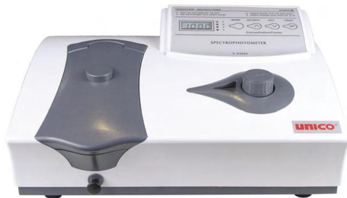
S1200 shown with Cuvet Holder closed