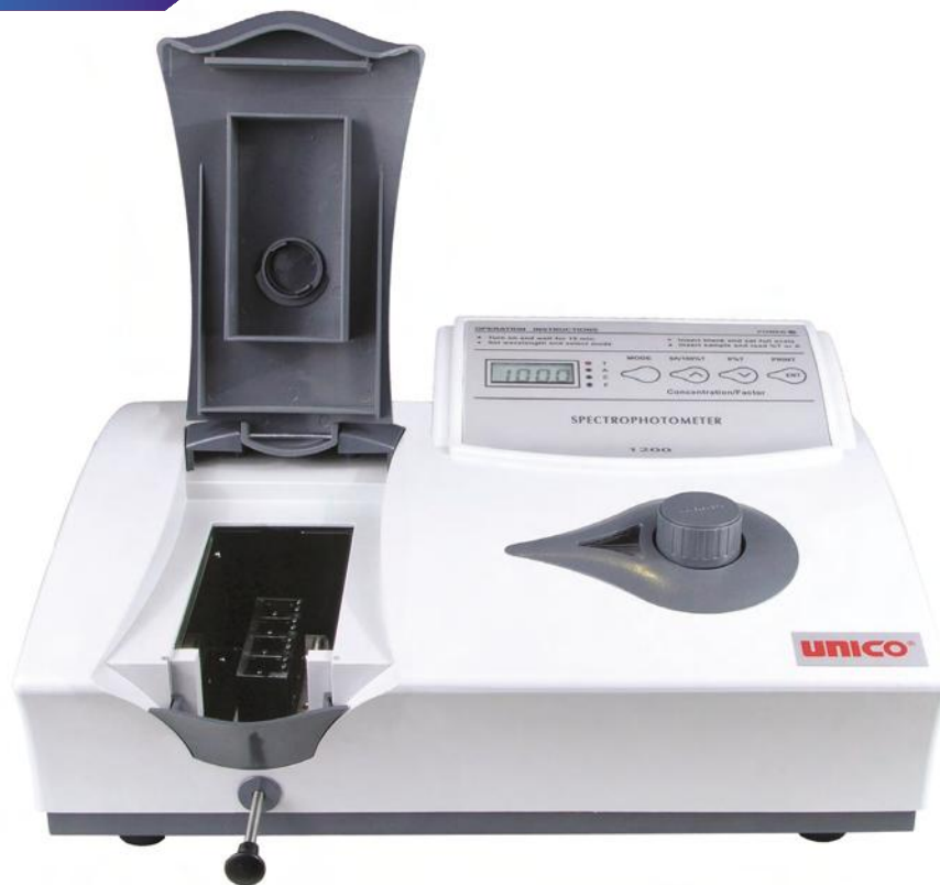
S1200's 50mm pathlength sample chamber accepts a wide variety of cells and accessories